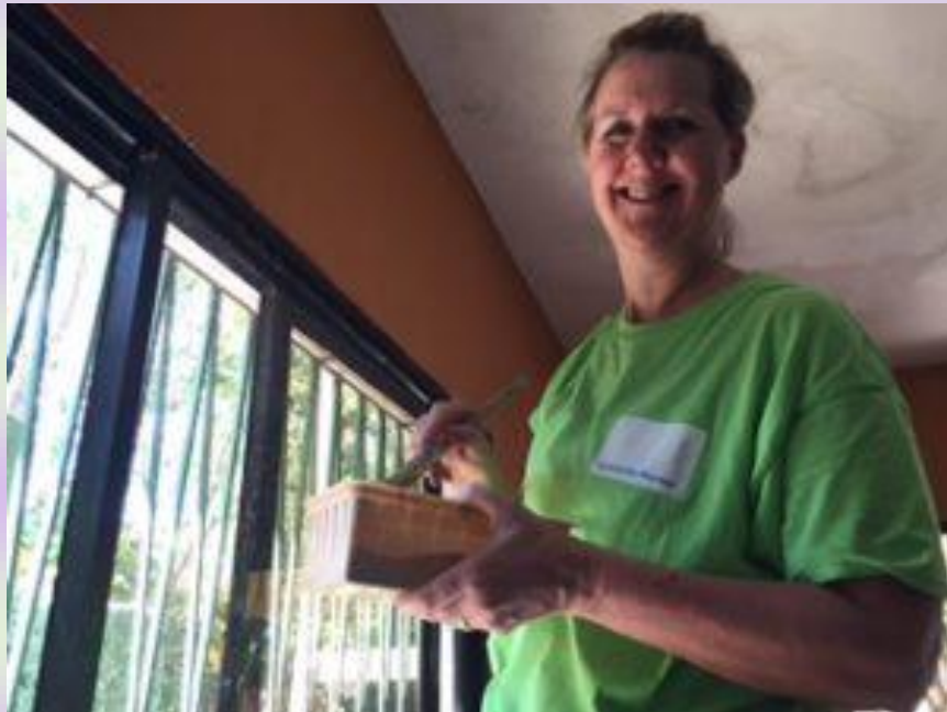
Grapy learning wall #2 and gave the other two walls in that room a much needed coat of paint.