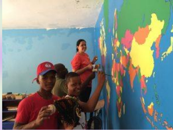
Even the boys got involved and loved it!