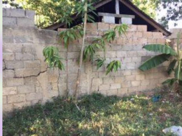
Doors to the present outdoor toilets that we'll replace: