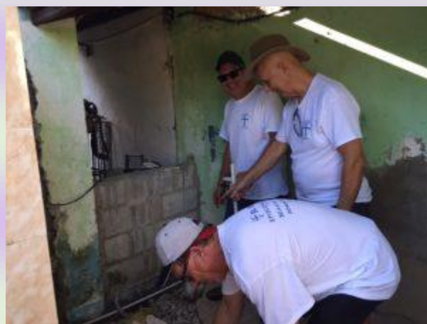
before shot of area where we'll build chicken coops: