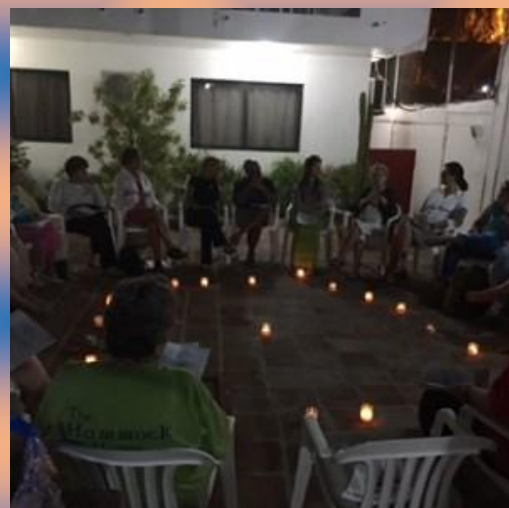
We thank God for a beautiful day.