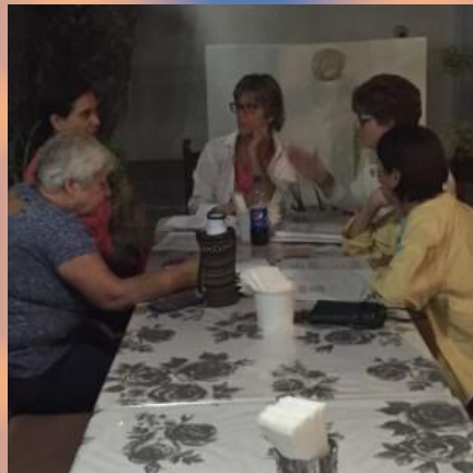
Planning prayer time for Thursday